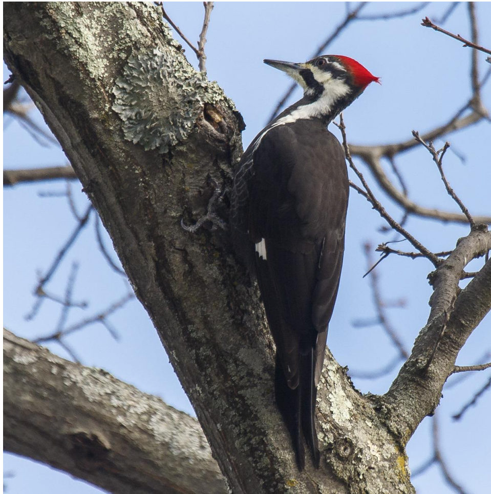
Photo 1. Adult female Pileated Woodpecker photographed at Beaver Pond Campground, Harriman State Park during Count Week. The number of Pileated Woodpeckers seen during this year, 15, breaks the old High Count record by five.