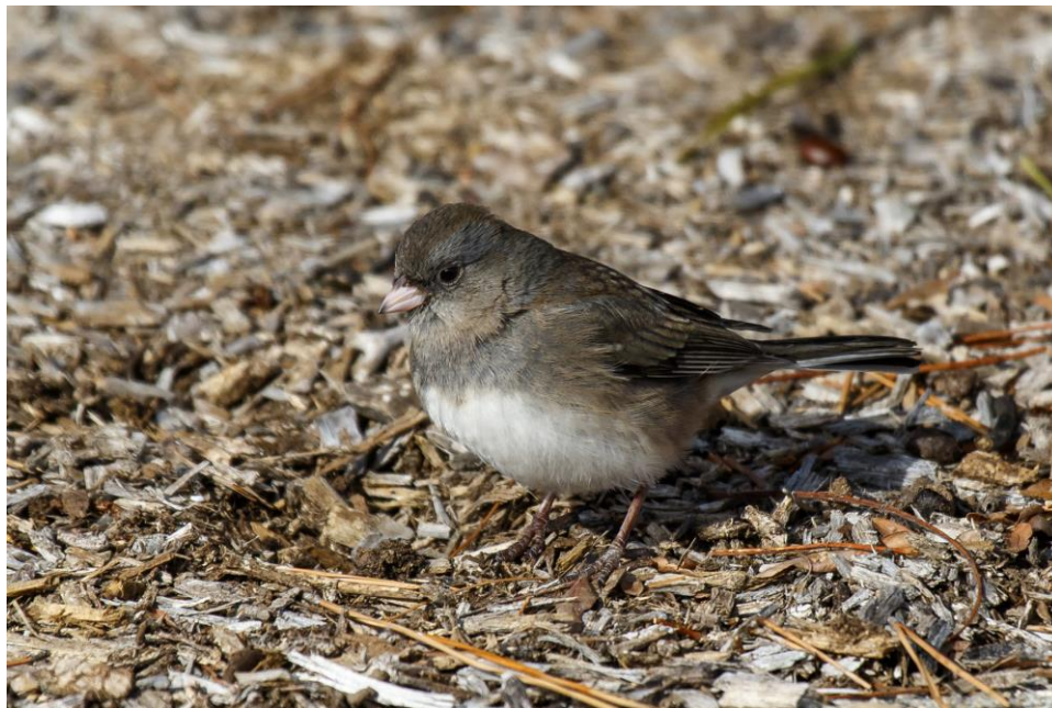
Photo 6. Dark-eyed Junco seen on 12/16/2016 (Count Week) at Haverstraw Marina (District 1). Juncos were the fourth most abundant species seen on Count Day, common in all Districts. (Photo: Alan W. Wells).