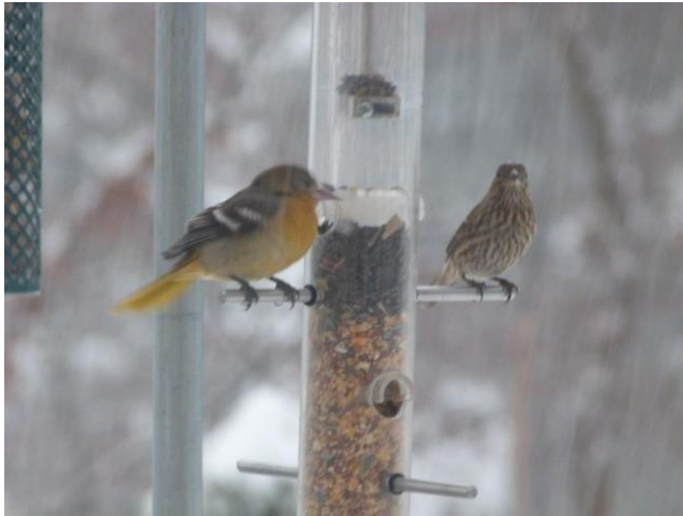
Photo 3. Count Week immature female Baltimore Oriole photographed at the feeder of Tom Dow. It was one of at least two Baltimore Orioles making an appearance at this feeder. Both were regular guests up until Count Day.