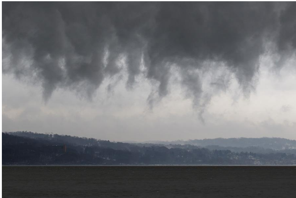
Photo 1. Cloud formations over Hudson River at 1:50 PM, just as cold front passes through.