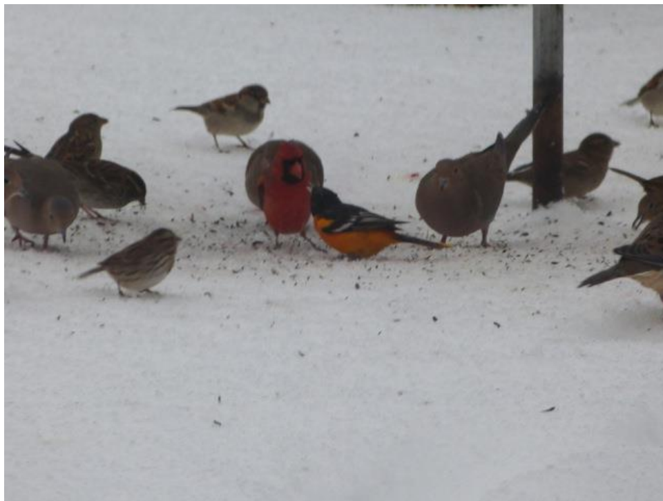
Photo 2. Count Week Adult male Baltimore Oriole photographed at the feeder of Tom Dow in Grandview. It was one of a least two Baltimore Orioles making an appearance at this feeder. Both were regular guests up until Count Day.