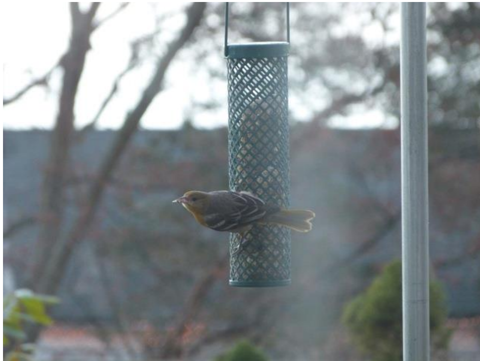
Photo 4. An immature Baltimore Oriole photographed at the feeder of Tom Dow on December 25, 2016 (after Count Week). Was it the immature that was the regular visitor prior to Count Day or a new bird?