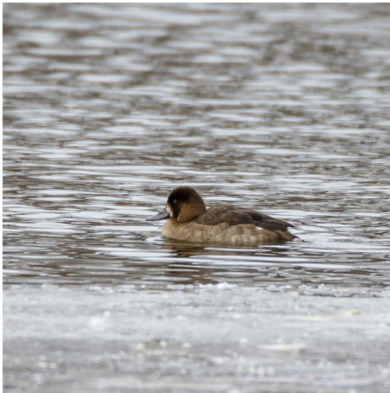
Photo 8. Scaup sp., probably Lesser Scaup, seen at Secor Pond, along Willow Grove Rd., Stony Point, NY, (District 1) on December 16, 18, and 21 (Count Day and Count Week). (Photo: Alan W. Wells).