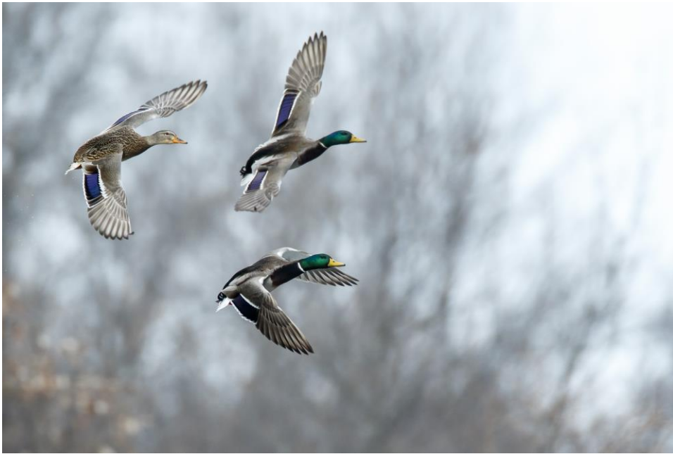
Photo 9. Trio of mallards at Secor Pond, along Willow Grove Rd., Stony Point, NY, (District 1). Numerous mallards were seen at the location both during Count Week and Count Day. (Photo: Alan W. Wells).