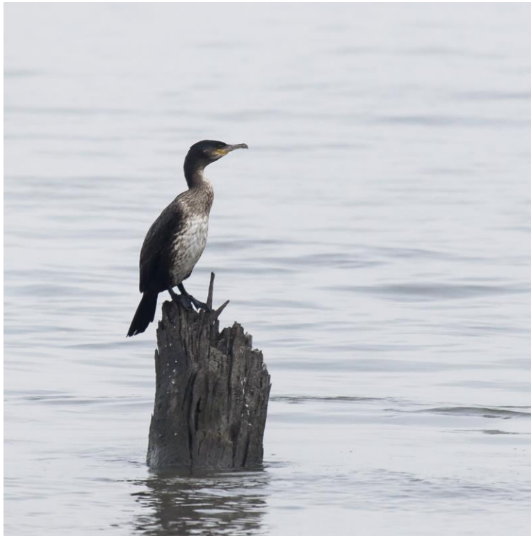
Photo 7 Great Cormorant seen on December 18, 2016 (Count Day at Bowline Pond (District 1).