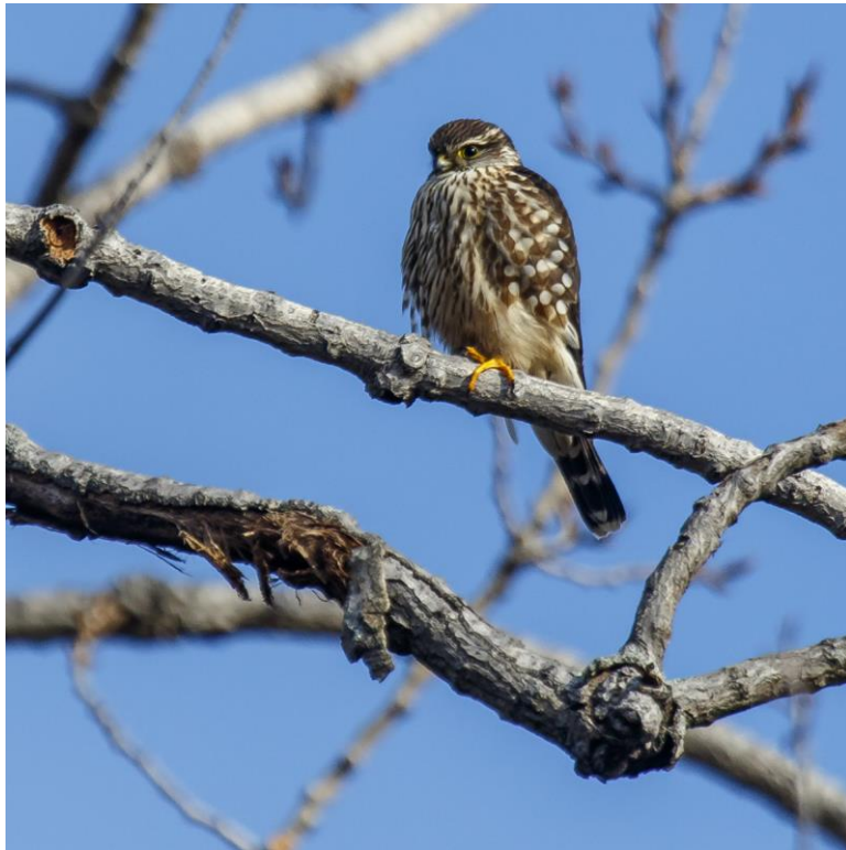
Photo 5. Merlin seen on December 16, 2016 (Count Week) at Bowline Pond (District 1). We were unable to relocate it on Count Day.