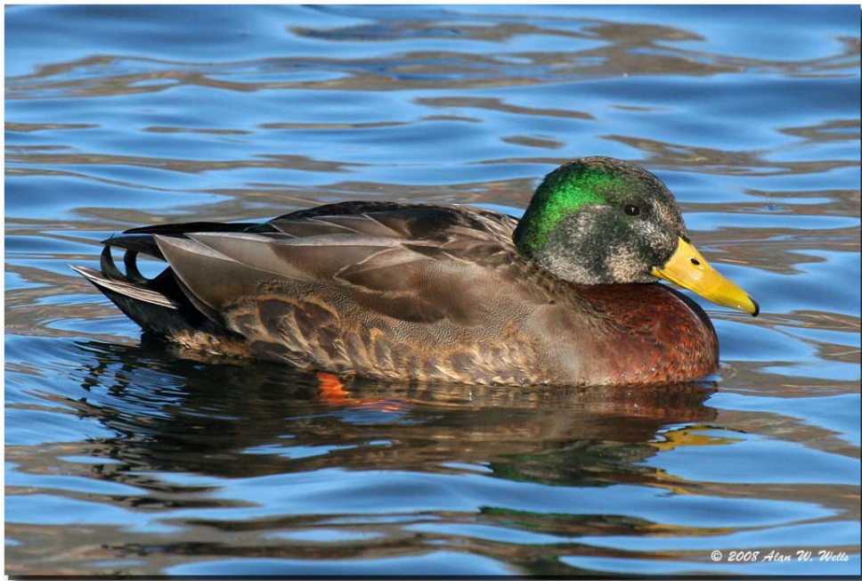
Photo 5. This Mallard x American Black Duck hybrid was discovered and photographed on a small pond at Letchworth Village on 12/13/08 during a pre-CBC scouting expedition. It was still present on count day.