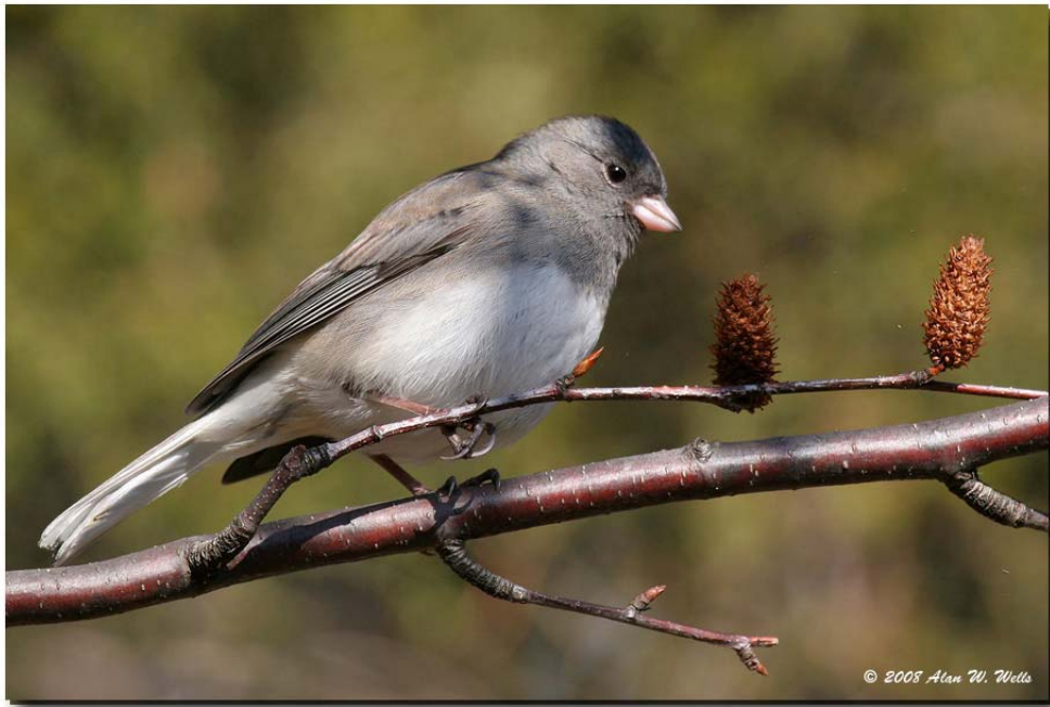
Photo 6. Hundreds of Dark-eyed Juncos and White-throated Sparrows were found at Stony Point Battlefield the day before the count. On count day, they were gone!