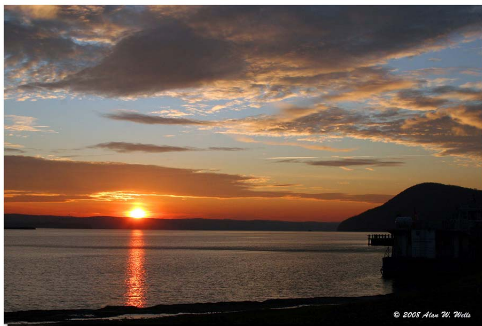
Photo 1. Christmas Bird Count Sunrise over Haverstraw Bay, Hudson River.

Highlights: Several unusual sighting occurred this year, including: Greater and Lesser Yellowlegs, Merlin, American Pipit, Black-crowned Night Heron, Black Vulture, Long-tailed Duck, and Common Redpoll. Killdeer and Cedar Waxwing were a surprising misses.