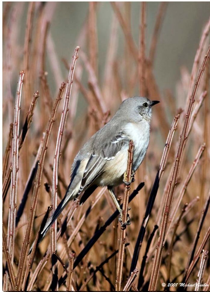
Photo 9. Micheal Garber photographed this posing Northern Mockingbird in Region 6.