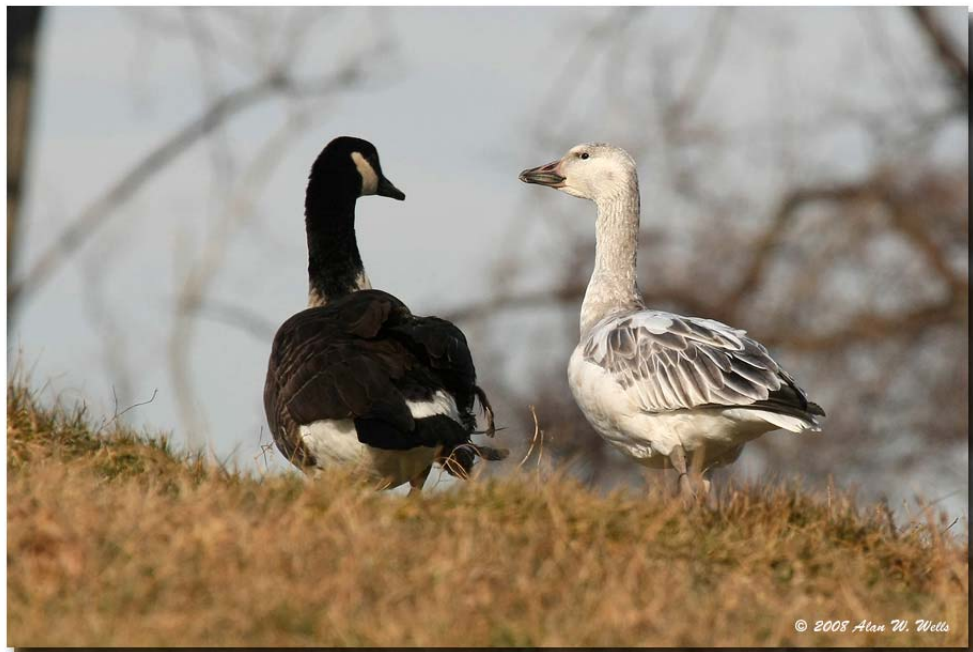
Photo 3. Best Buds! This odd pair of Haverstraw Landfill geese were seemingly inseparable.