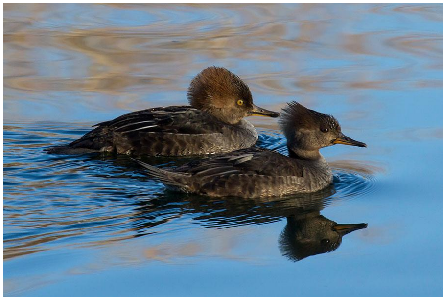
Photo 5. Two female Hooded Mergansers found on the Haverstraw Bay County Park fishing pond (District 1). Nine were present on the pond. (Photo: Alan W. Wells).