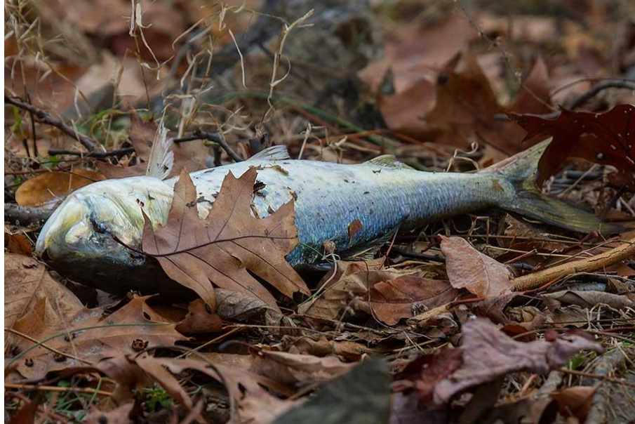
Photo 4. A sure sign that Bald Eagle are around are dead bunker (Atlantic Menhaden) found far away from the Hudson River. (Photo: Alan W. Wells).