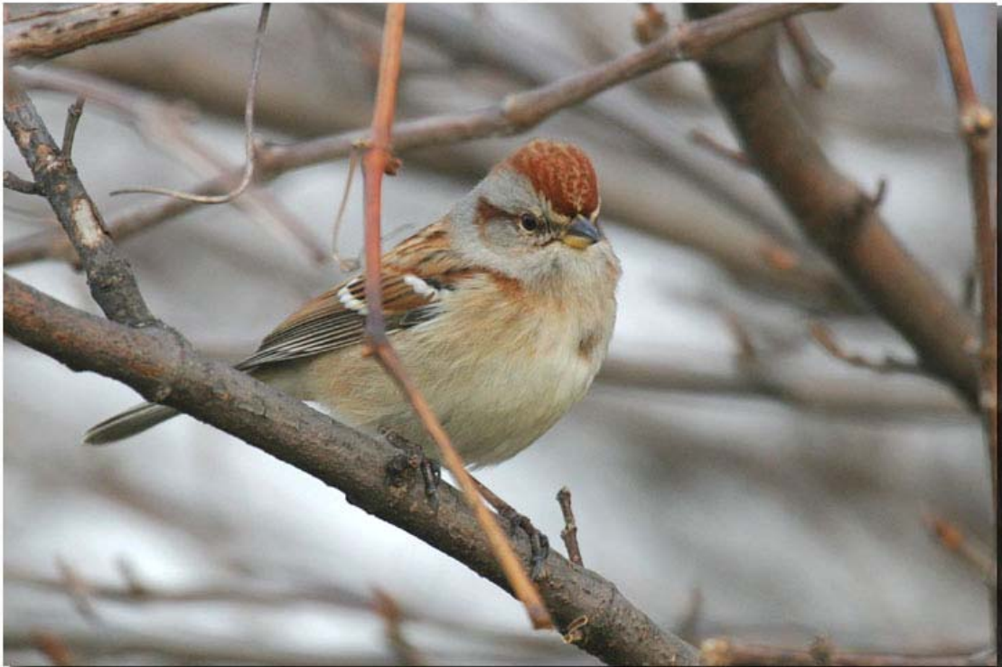
Photo 5. American Tree Sparrow has been seen during all 60 RAS Christmas Counts.