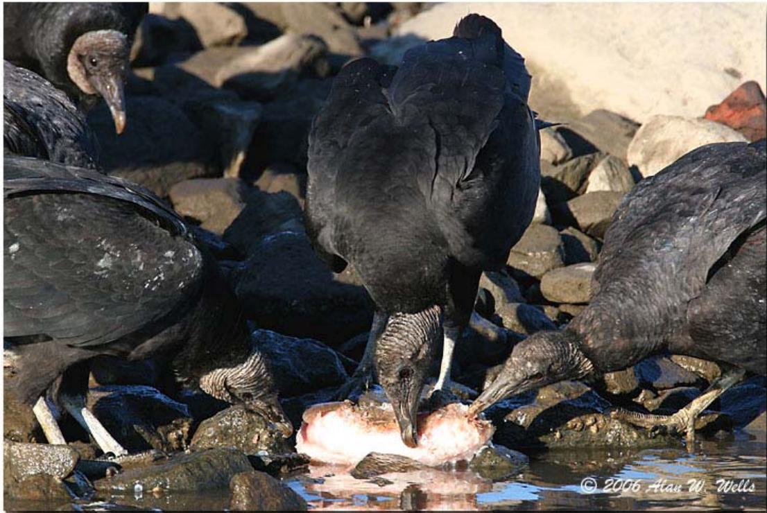
Photo 4. Black Vultures are moving into the county in rapidly increasing numbers. It was first recorded in 1995 with 3 individuals. Two were seen in 2001, 2002, and 2003. In 2005 a record 16 were seen. This year's 53 more than tripled the 2005 record.