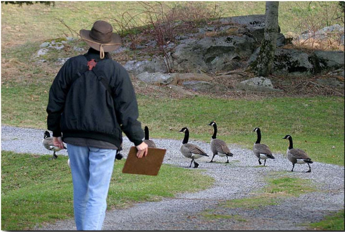
Photo 8. Yeeee Hawww! Git along little dogies, we haven't got all day!