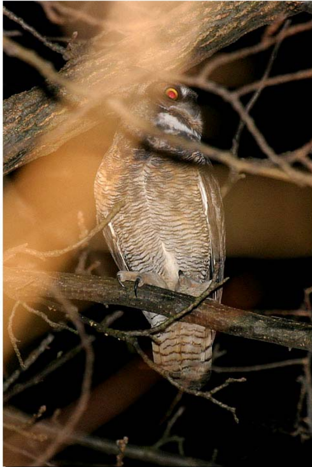
Photo 2. Great Horned Owl. I know this is a terrible picture (red-eye, stray branches and all) and I normally would not include a picture like this. However, I felt obligated to demonstrate to all those who braved (for naught) the cold during the December 2nd owl prowling that there really are owls at Stony Point Battlefield!