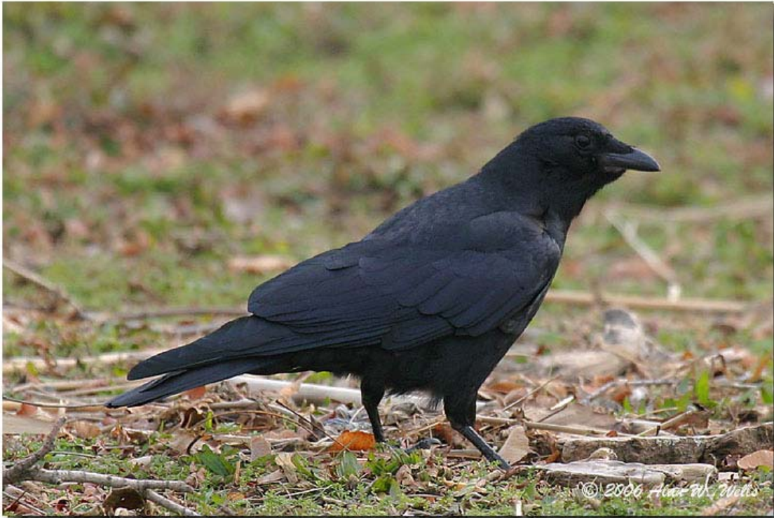
Photo 6. Fish Crows can be nearly impossible to distinguish from the American Crows. Luckily the “uh-uh” call of this species is very distinctive!