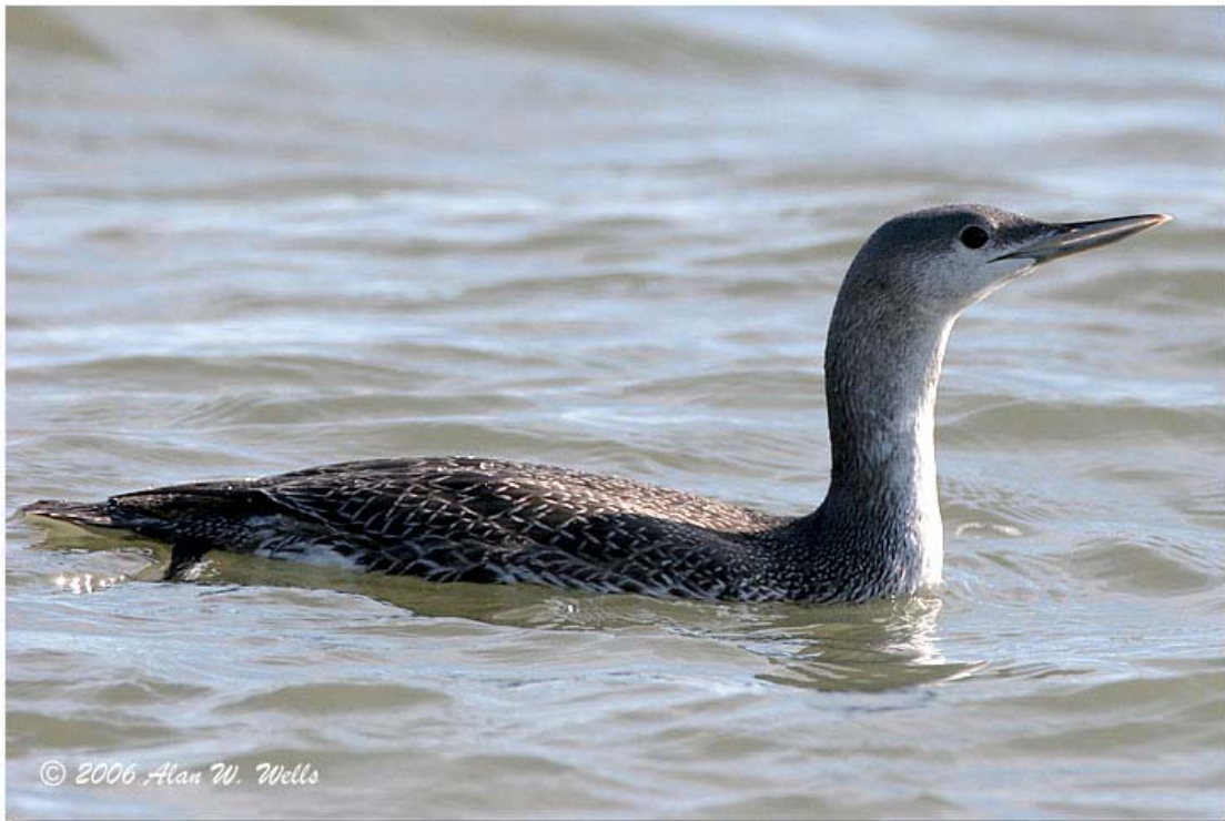
Photo 7. Drew added a Red-throated Loon during the count week period.