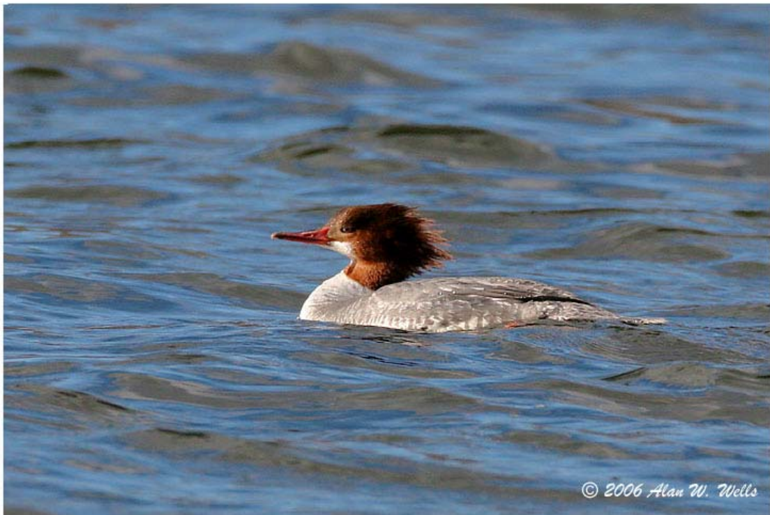
Photo 3. Common Merganser was the most abundant species in 2006. This female was photographed at Rockland Lake shortly after the count.