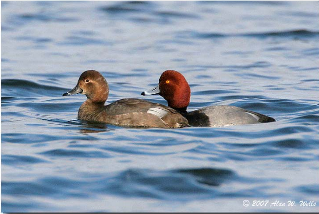
Photo 4. A group of Redheads also took up temporary residence at Rockland Lake just in time to be included. Photo taken December 25, 2007.