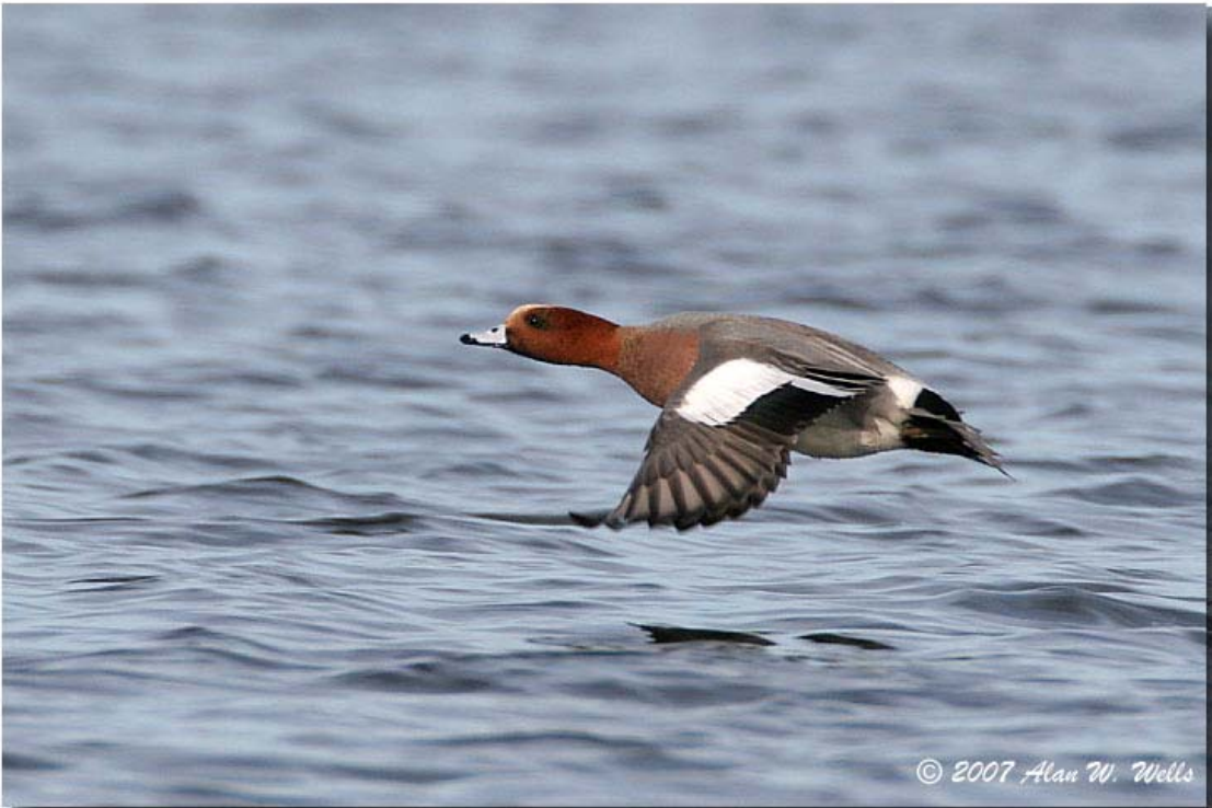
Photo 3. Luckily it stayed to be included in the RAS CBC. This was the first time that this species has occurred on our Christmas count. Photo taken on December 29, 2007.