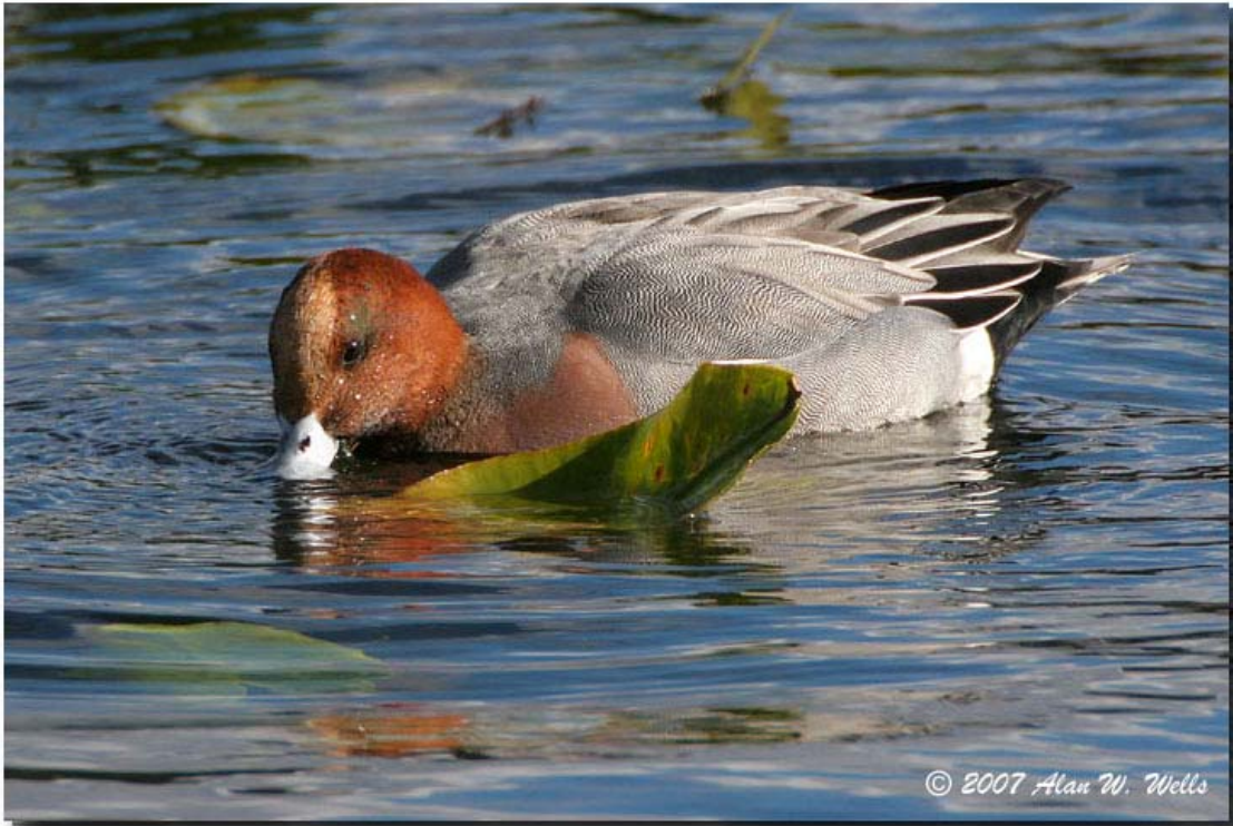
Photo 2. This drake Eurasian Wigeon at Rockland Lake has been since early November. Photo taken on November 16, 2007.