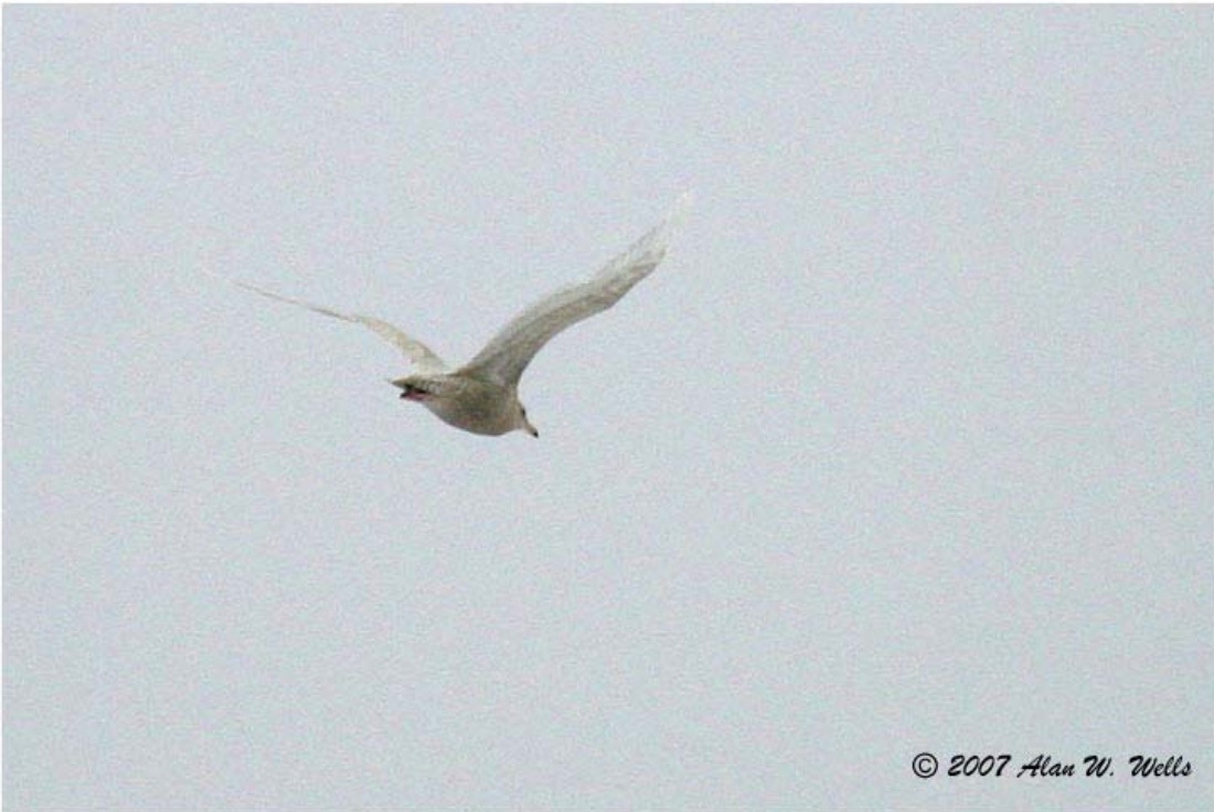
Photo 7. Group 1 got repeated, but distant views of a white-winged gull species. It was initially identified as an immature Iceland Gull, but based on a series of poor photos, several reviewers concluded that it was an immature Glaucous Gull. (Sometimes a poor photo is all you get!).