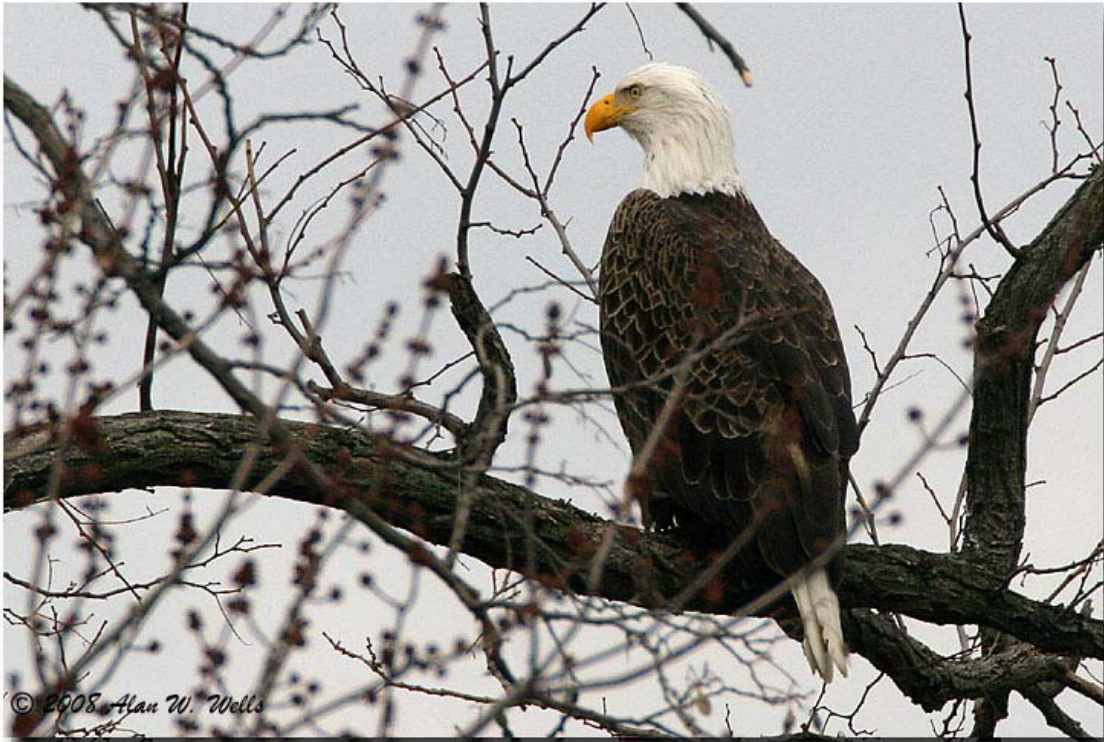
Photo 6. Bald Eagles are becoming common winter visitors to the lower Hudson Valley. This year's count of 29 was an all-time high count for RAS, shattering the previous high of 11 reported in 2006. Photo taken January 6, 2008.