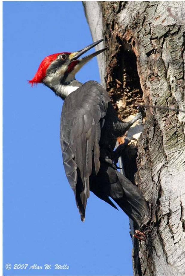
Photo 5. Pileated Woodpecker, such as this one at Rockland Lake, are a treat to see. Only four were reported for this year's count. Photo taken December 28, 2007.